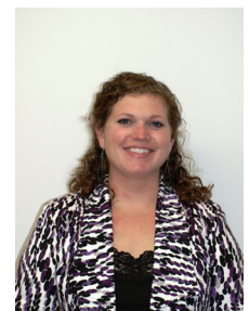
Miriam Carman Pearl Lower Elementary

The mission of Pearl Public School District is to prepare each student to become a lifelong learner, achieve individual goals, and positively impact a global society.