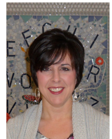
Beth Hayes Pearl Lower Elementary and Pearl Public School District