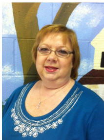
Sheila McQuirter Pearl Junior High